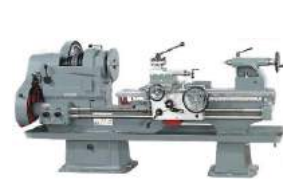
HEAVY DUTY LATHE MACHINE