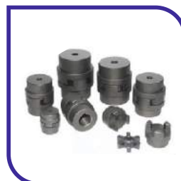
HYDRAULIC JAW COUPLING