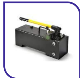
HYDRAULIC HAND PUMP