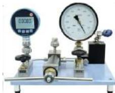
PRESSURE GAUGE TESTING RIG