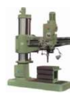
HEAVY DUTY DRILLING MACHINE