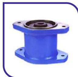
HYDRAULIC EXTENSION BRACKET