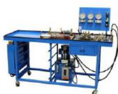
VALVE & PUMP TESTING BENCH