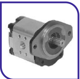
HYDRAULIC GEAR PUMP