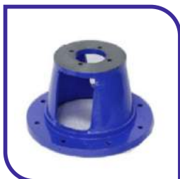
HYDRAULIC BELL HOUSING