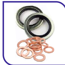
HYDRAULIC BONDED SEAL AND COPPER WASHER