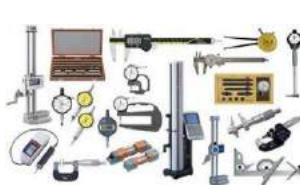
PRECISION MEASURING INSTRUMENTS